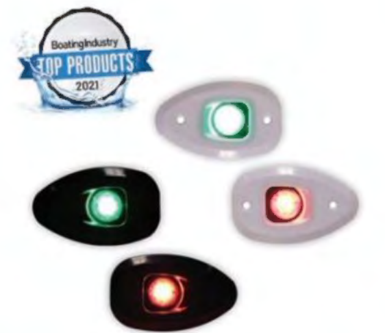
Lalizas Micro Led Series