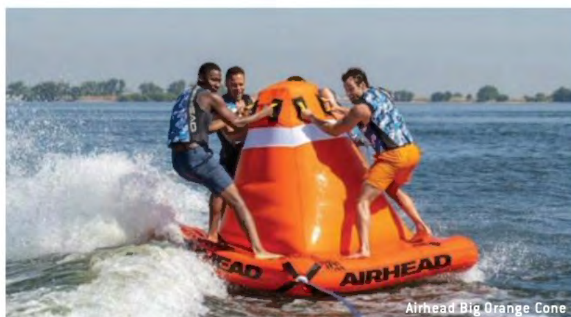
Airhead Big Orange Cone