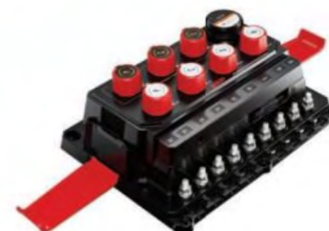
Bep Marine Smart Battery Hub