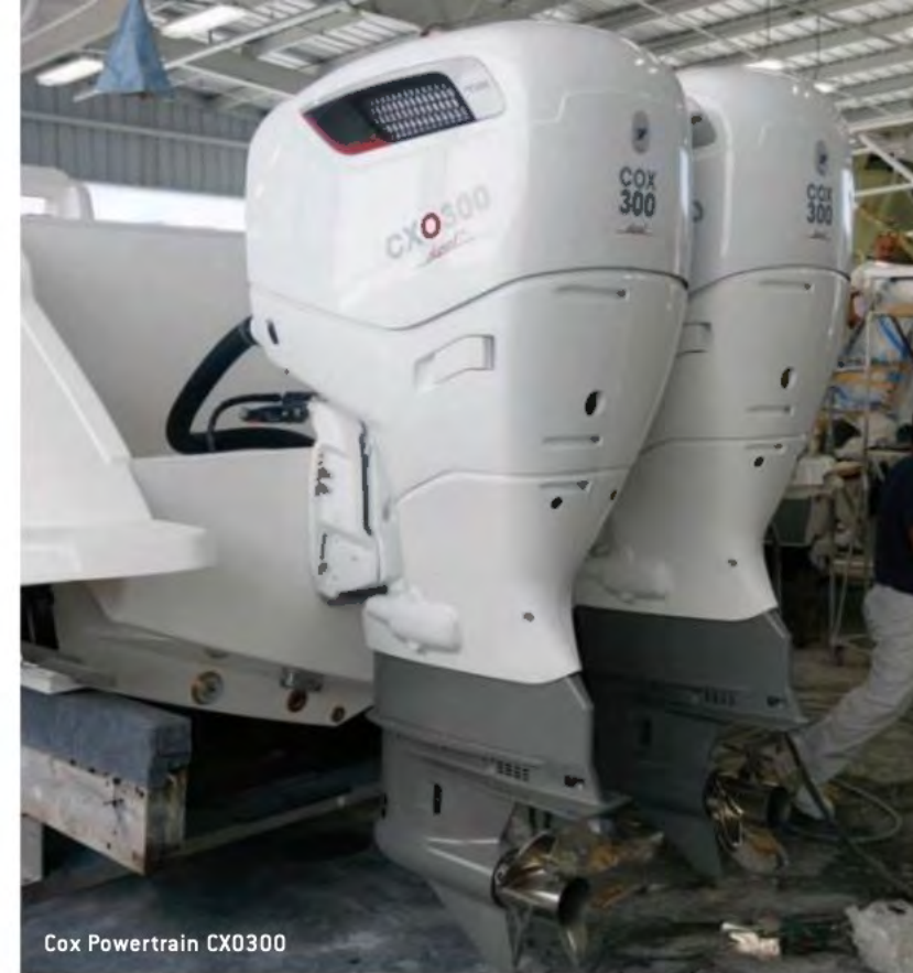
Cox Powertrain CX0300