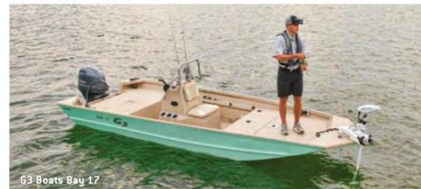
G3 Boats Bay 17