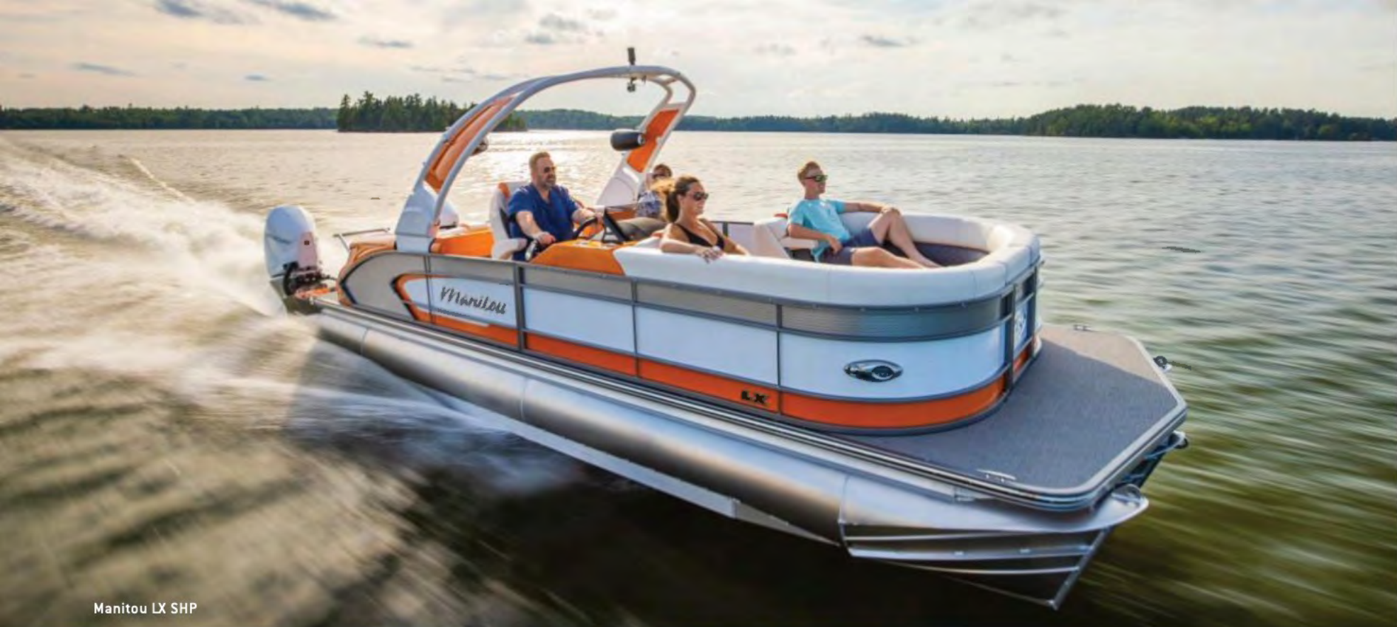
Manitou LX SHP